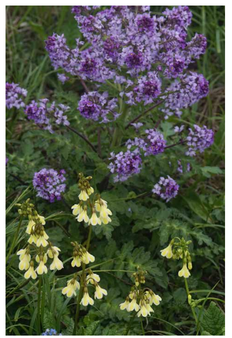
Primula serratifolia & Megacarpea delavayi

After a break for lunch in the wildlife centre we climbed up towards the lake seeing the red bells of Rhododendron haematodes and the yellow of R. lacteum , the handsome foliage of Rodgersia pinnata and superb stands of Megacarpea delavayi peppering the turf and mingling with Primula serratifolia . Whilst we admired these a stunning male Golden Bush Robin appeared and provided a wonderful show as he went back and forth to a hidden nest under the boardwalk, each time carrying